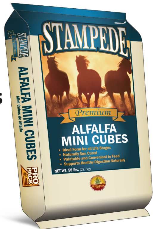
STAMPEDE ALFALFA MINI CUBES